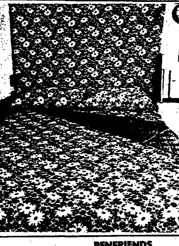
Galina of Ashdod has brought out a new line of matching sheets, quilt covers, pillowcases, bedcovers and throw cushions. It comes in a wide variety of patterns, colors and sizes.